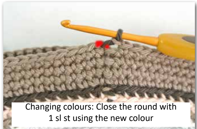
Changing colours: Close the round with 1 sl st using the new colour