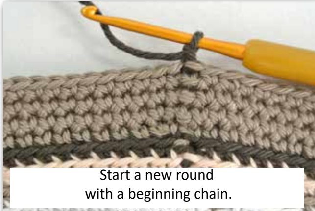
Start a new round with a beginning chain.