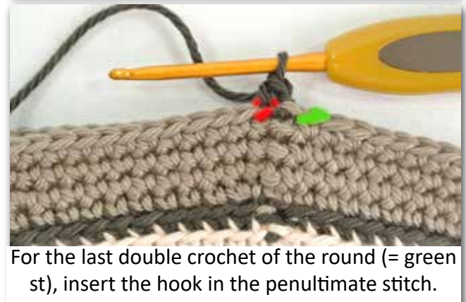
For the last double crochet of the round (= green st), insert the hook in the penultimate stitch.