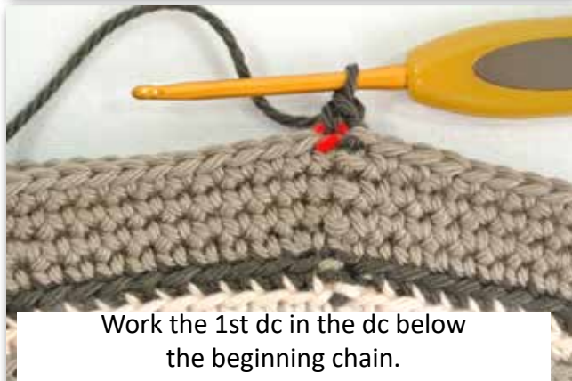
Work the 1st dc in the dc below the beginning chain.